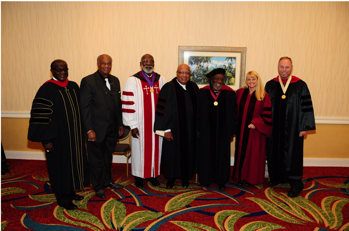
A few of the platform guests from the 2014 International Seminary Commencement

On the day of Pentecost good news came to the lost Thousands came in Jesus' Name redeemed on Calvary's cross. So take the sword within your hand and go to every land. Truth does not change; Christ is the same. Obey His every command