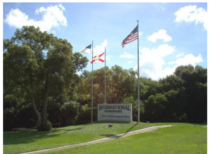
View of flag overlook from Highway 441 (Orange Blossom Trail)

Contributions may be made by remembering International Seminary in your will. The legal form of bequest for International Seminary is as follows: I give, devise and bequeath to International Seminary, a Florida non-profit corporation located in Plymouth, Florida, the sum of $_____ (or property herein described), to be used by the Board of Regents as it may deem advisable for the benefit of the students at International Seminary.